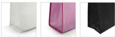
NW-6V Full White NW-7V Pink NW-15V Full Black